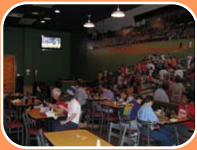
Gatti Town Outing!