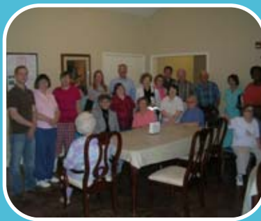
Bradford Chapel Baptist Church-Senior Adult Group provides lunch for SON Valley! We enjoyed the food and the wonderful piano playing!