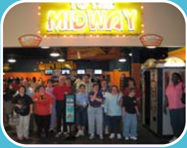
Gatti Town Outing!