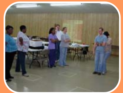
SON Valley staff participate in MANDT Training!