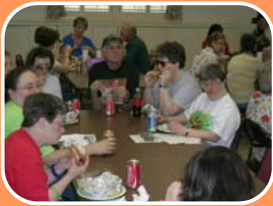
Lunch at the Canton Flea Market!