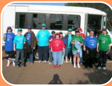
Residents begin baseball!