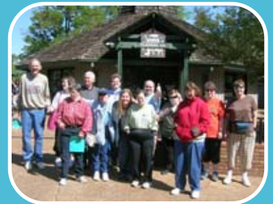
Visit to the zoo!