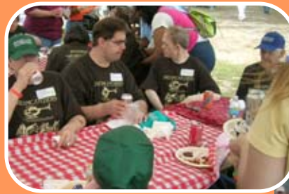
Residents attend Dreamcatcher Ranch!

We appreciate all of their generosity and invite other churches to join in a monthly pledge. That's what will build Phase II and beyond.