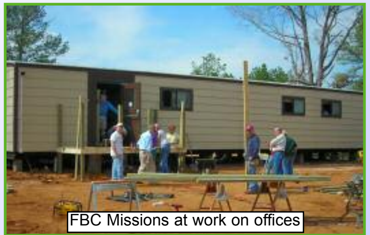
FBC Missions at work on offices